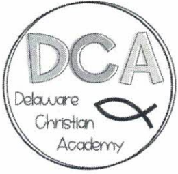
Photo Release Form